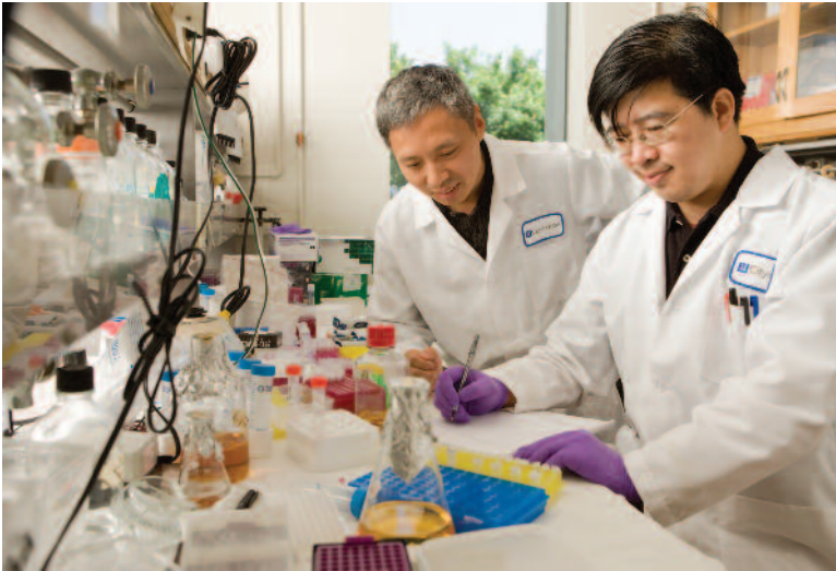
City of Hope researchers search for a cure for diabetes.

A new National Office Products Industry initiative will direct funds from personal giving to establish an endowed professorship in diabetes research.