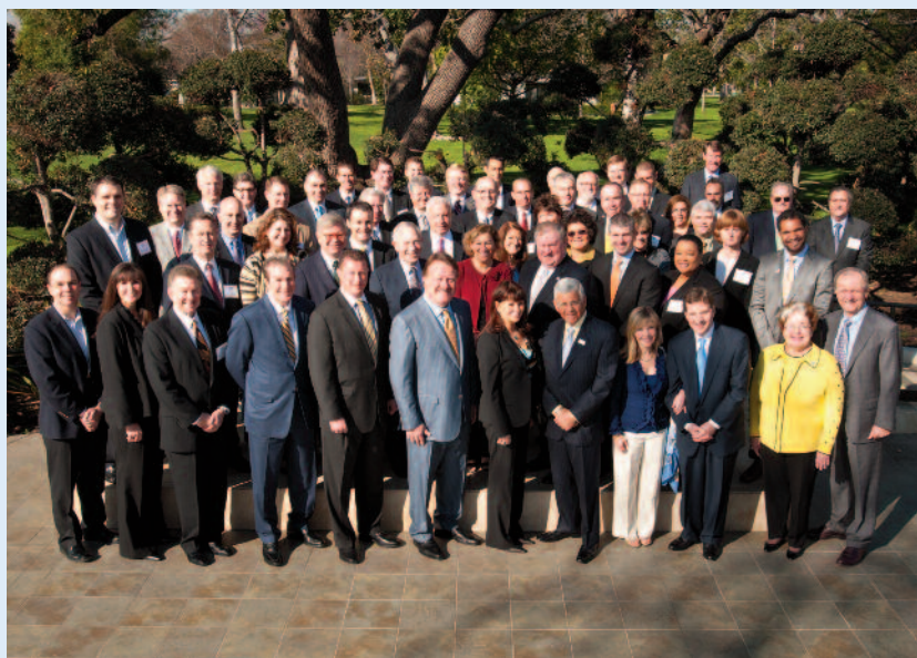
The National Office Products Industry gathers at City of Hope for the annual tour.

Leaders from the National Office Products Industry recently traveled west to take part in the traditional kickoff of their fundraising year in support of City of Hope.