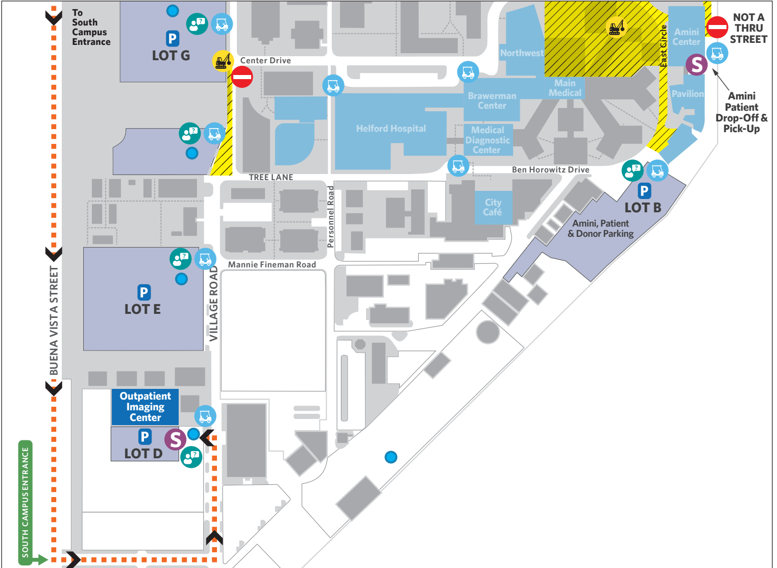
Pedestrian access from parking Lot D