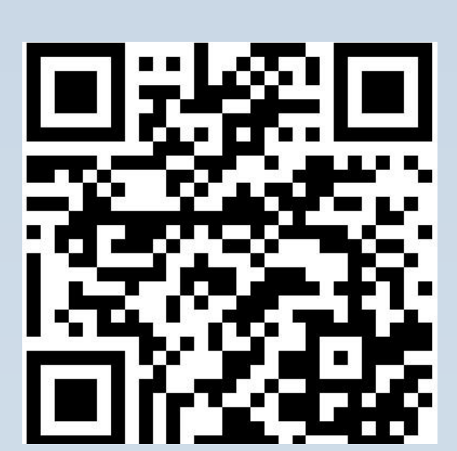
City of Hope Program Page