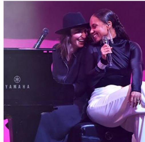
Sara Bareilles and Alicia Keys

The star-studded celebration culminated with an afterparty, deejayed by DJ Trauma. Luminaries like 21 Savage, Swizz Beatz, Chloe Bailey, Bonnie Hunt, Jimmy Jam, DJ Khaled, Zara Larsson, Natalie Martinez, Meghan Trainor and Daryl Sabara, Forest Whitaker were in attendance.