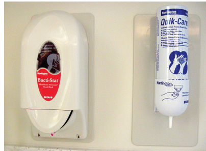
Antimicrobial (medicated) soap

Plain soap: detergents that do not contain antimicrobial agents or have very low concentrations of antimicrobial agents. Effective simply as a preservative.