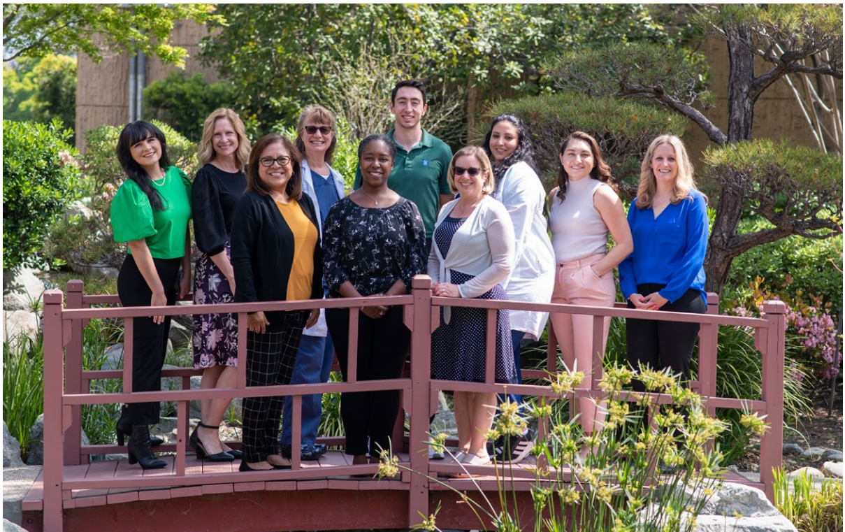
City of Hope's Adolescent and Young Adult Team

City of Hope's Adolescent and Young Adult Team aya@coh.org