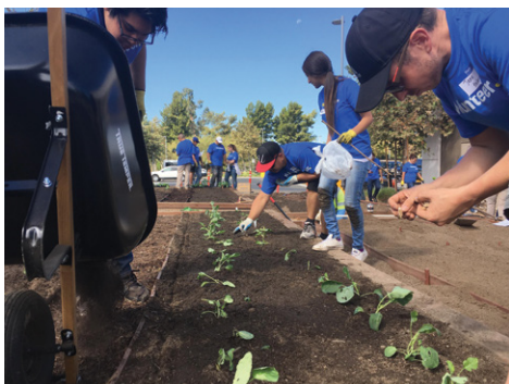
■ BestBuy volunteers help to plant Garden of Hope.